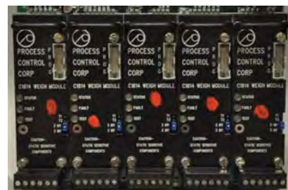
New Weigh Module Chips