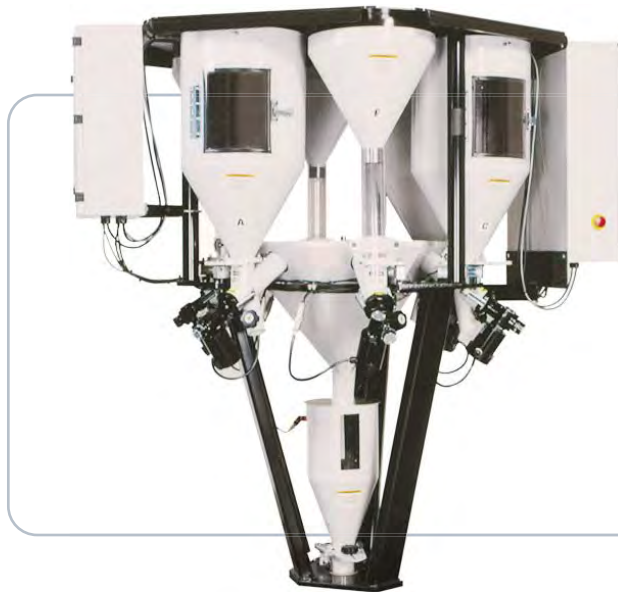
X Series Continuous Gravimetric Blender