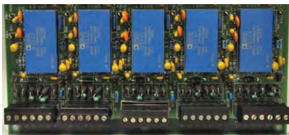
Old Weigh Module Chips

Note: Prices for Weigh Module Upgrade kits are available upon request to PCC.