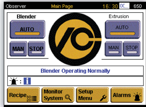
New Operator Interface