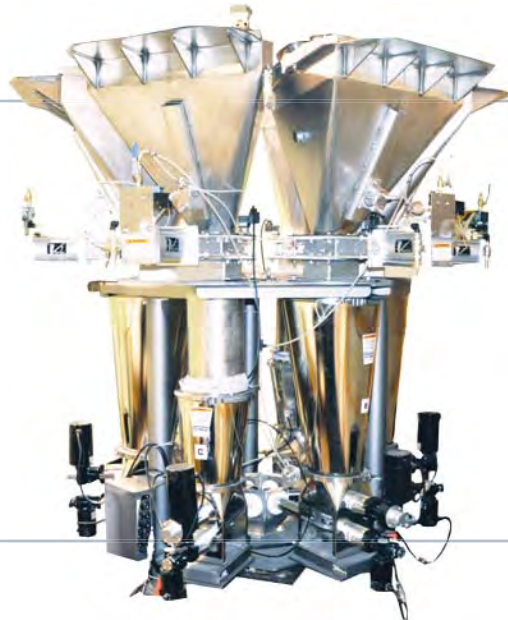
XU Series Continuous Gravimetric Powder Blender

Process Control offers a new selection of upgrades for Continuous Gravimetric blenders, including a color touch screen controller, brushless motors and drives, and a DSP weigh module upgrade kit, that will improve your blender's performance and longevity. These upgrades not only add years to your blender's life, but can actually improve your blender's accuracy as well. These upgrades offer a way to simplify the blending process and postpone future blender replacement, making operation easier and saving you money all at once. Your older Continuous Gravimetric blender controls, drives, and weigh module chips are facing the threat of becoming obsolete; ensure that will not happen by upgrading today.