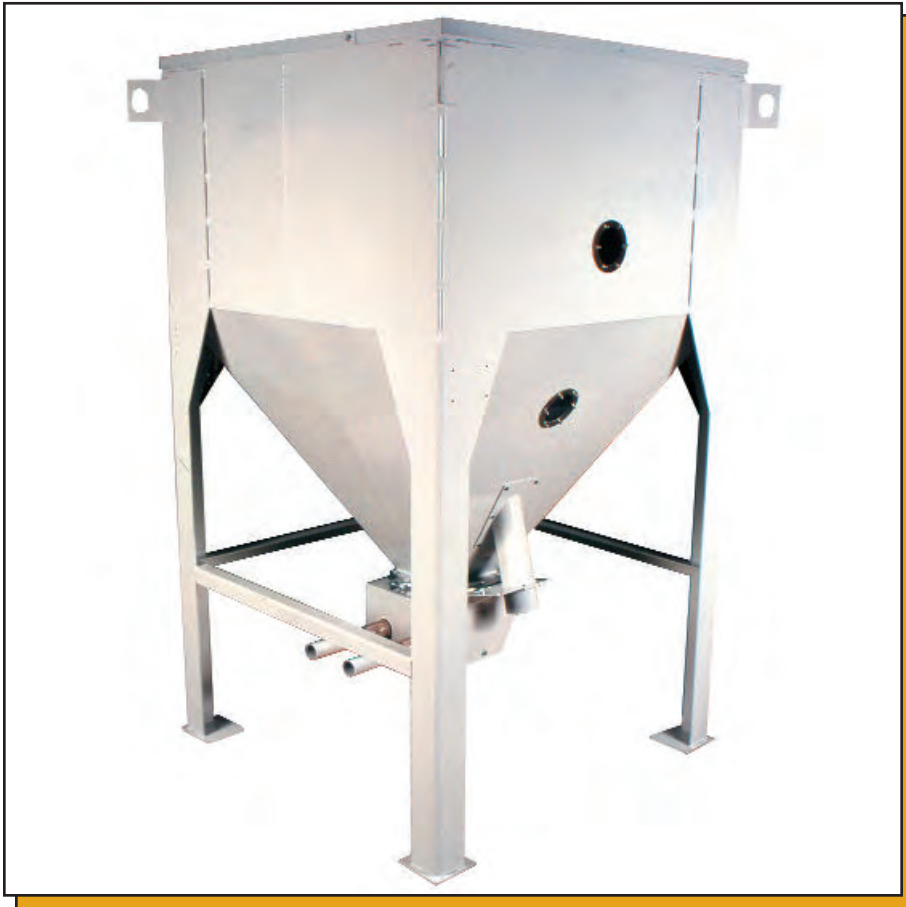
HS Series: Economical, space saving in-plant storage bins for finished or raw materials.

The HS Series Surge Hoppers from Process Control are ideal for in-plant storage of both raw materials and finished product. They are available in a variety of sizes and capacities to maximize and conserve handling time, space, and energy. Standard capacities range from 30 cu.ft. to 290 cu.ft. and are available with hopper slopes of 45° or 60° depending on the flow characteristics of the material being stored. Custom designed bins with 70° hopper slopes can also be supplied for regrinds or difficult flowing materials.