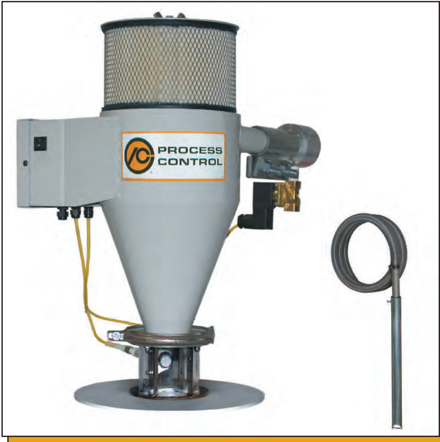
The LC Series Compressed Air Vacuum Loader. (Shown above is a LCC with custom mounting flange)

The LC Series vacuum loader from Process Control is a space efficient, self-contained unit which uses compressed air to convey materials at rates up to 850 PPH. It can be used effectively in any application that calls for raw material delivery.