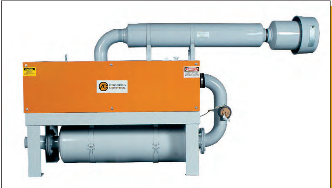
The P Series: pressure unit for conveying plastic materials (pictured is a P3040)

Process Control Corporation specializes in equipment for conveying plastic materials. Our equipment is designed to stand up to the toughest demands of your application, including high material flow rates, multiple distribution points and long conveying distances.