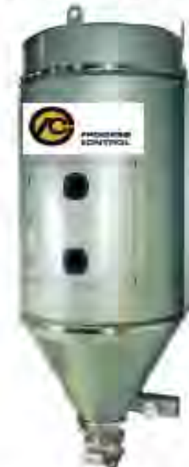
* 15-18,000 lb (7-8,165 kg) Capacity 375-474 ft 3 (10.6-13,422 liters) *Based on polycarbonate pellets @ 38 lb/ft 3