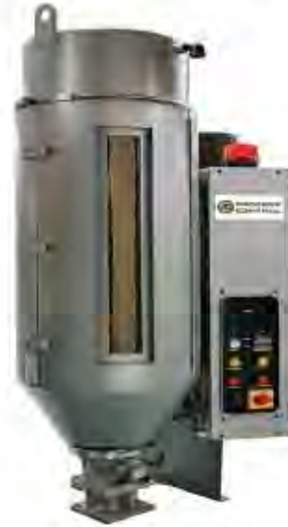
Membrane Resin Dryer Up to 225 lbs/hr