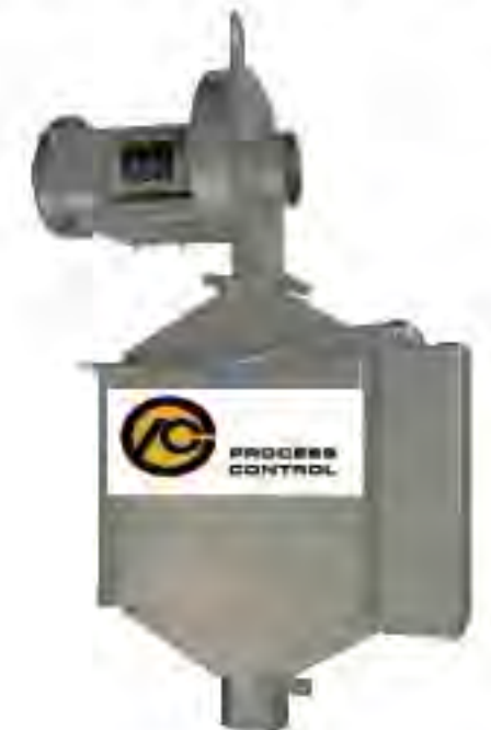
Airflow: 80-7,500 cfm High Heat to 400 deg F