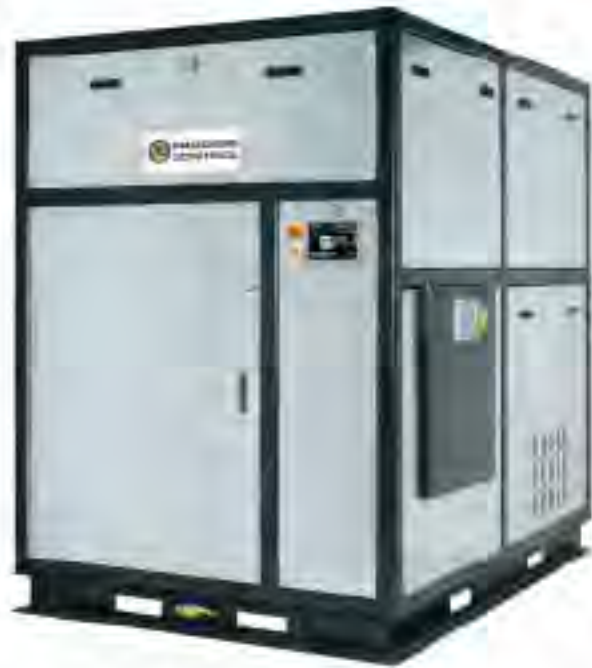
Large Desiccant Wheel 2,500-5,000 lbs/hr