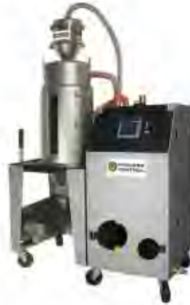
Portable Drying and Conveying 25 to 300 lbs/hr