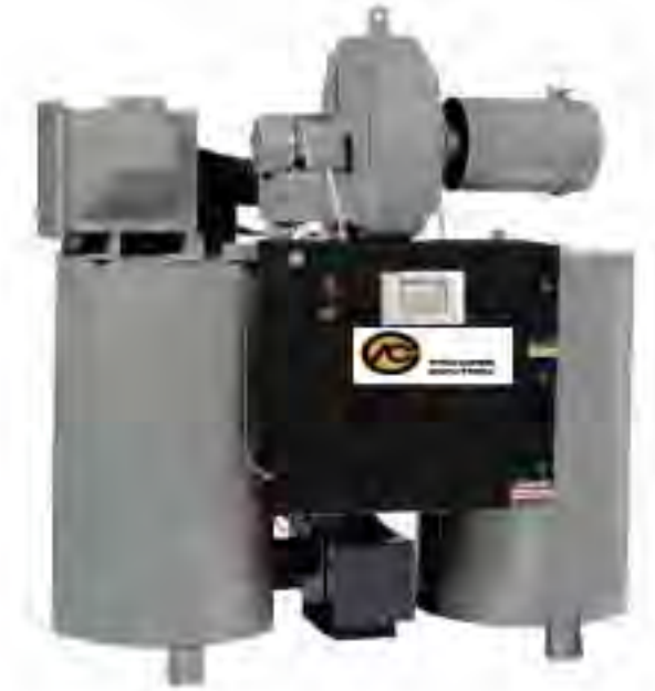
Dual Bed Desiccant Dryers Up to 5,000 lbs/hr