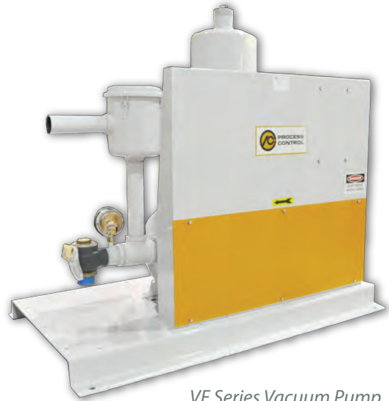
VF Series Vacuum Pump