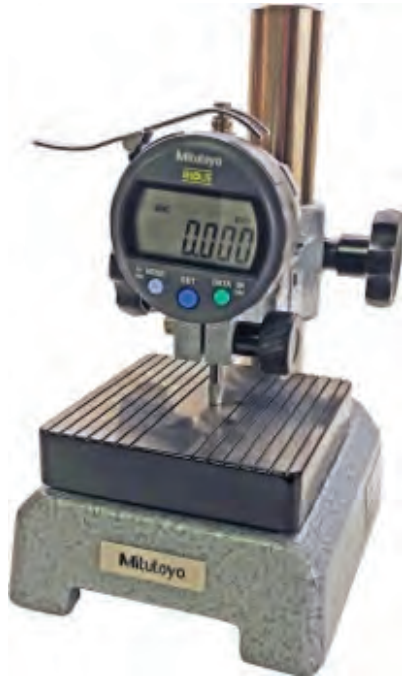
Model 543-392 Battery Powered Digital Indicator. Shown with Model 7007-10 Dial Gauge Stand with 90 mm square anvil. Indicator equipped with lift lever and Digimatic™ Serial Output.