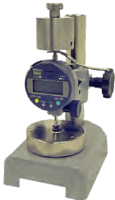
Model 543 Dead-Weight Digital Indicator Shown with 7002-10 Dial Gauge Stand upgraded with Parallelism Adjustable Anvil option. Indicator equipped with lift lever and Shown with Add-Weight, Lift Lever and Digimatic™ Serial Output.