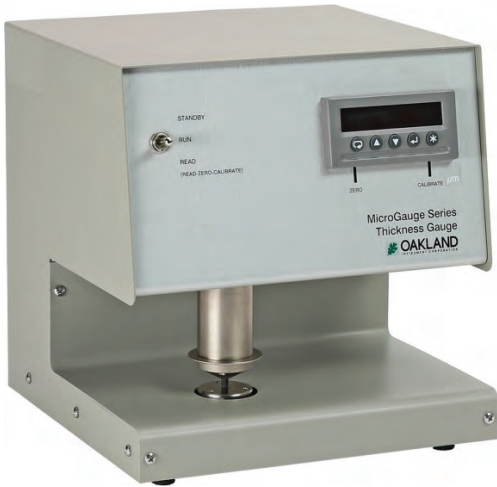
Model MX-1100 Profiling Caliper Gauge with Isolated C-Frame feature. Gauge equipped with RS-232 Serial Output

Full-Featured Automatic Caliper Gauges for Film, Sheet and Paper