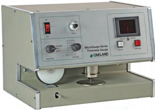
Model MX-1210 Profiling Caliper Gauge with Isolated C-Frame feature. Gauge equipped with RS-232 Serial Output.

Full-Featured Automatic Caliper Gauges for Film, Sheet and Paper